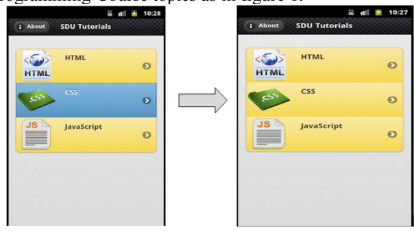
Figure 1 Main menu of application

In main menu you can select one of Web Programming Course topics as in figure 1.