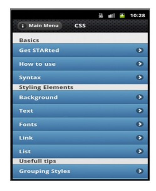
Figure 2 List of topics

Each topic consists of subtopics with explanations, pictures, examples and other things as in figure 2. You can scroll them. Choose the one you like by clicking over it figure 3.