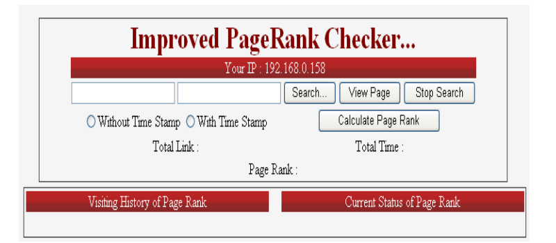
Figure 5.2.1: Normal View to Calculate PageRank with IP address

In addition to the implementation of Time aware incremental pageranking algorithm, the normal view of display screen shows the IP address of user. The display screen also includes the grid view of Visiting history of the pagerank and current status of pagerank (see figure 5.2.1).