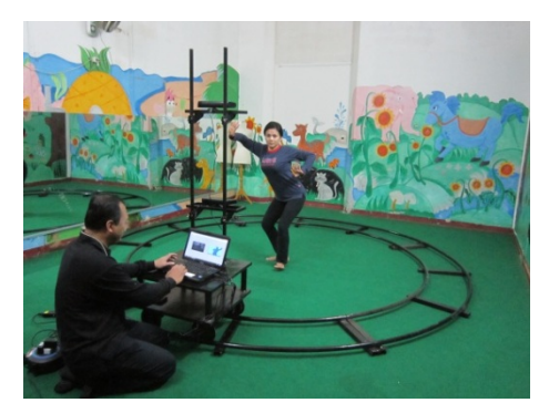
Figure 3. Equipment Setting for Data Acquisition

The dance gestures performed by the Bali traditional dancer are captured using a static mounted depth sensor that produces skeleton coordinates at the rate of 30 fps and recorded in an ONI file format (see Figure 3). The resolution of the depth map is 320×240 and resolution of the RGB image is 640×480. In this study, the total of 63 samples over 11 basic dances was recorded. Data recording starts with initial step to calibrate the sensor (the dancer in the position of body stand up straight and both hands up). The length of the dance gestures range from 100 to 200 frames. For simplicity reason, each gesture is recorded without Bali traditional music.