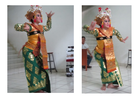
Figure 1. Two Poses of the Legong Dance Performance

Based on its function within a ceremony, Bali traditional dances can be categorized into: (1) wali dance which have its origin in ritual and sacred dances; (2) bebali or semi-sacred dance are the dances which are not necessarily connected with ritual (e.g. Legong dance); and (3) balihbalihan dance which are public dances for entertainment purposes [2]. Although having some differences, many Bali traditional dances also share some common dance gestures.