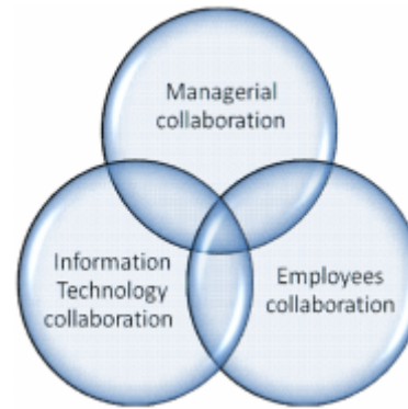
Fig. 3 Collaboration Model

Collaboration and coordination between the devices of the State classified as a managerial issue, and by default its effect directly on the technical aspects. To solve this problem, we suggest the collaborations model, as shown on figure 3. Collaborations model consists of three parts; managerial, information technology, and employee's part.