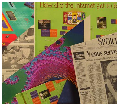
a) The right image of the stereo pair

The stereo pair images used as inputs were obtained from middlebury university database. The images are rectified and thus satisfy the epipolar constraint and the intensity assumption. After obtaining the disparity map, median filtering is used to find the disparity of unmatched pixels. Median filter also discards any singular errors and makes the disparity map smooth. The results are as follows: