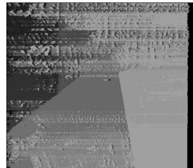
c) Output of traditional local area based correspondence algorithm for color images