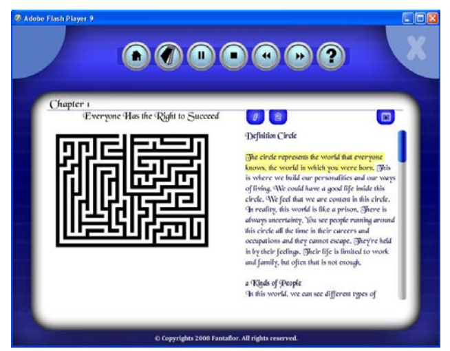
Figure 2 IBook Chapter View

These quizzes can be user-defined and how this is achieved is explained in detail in the next section.