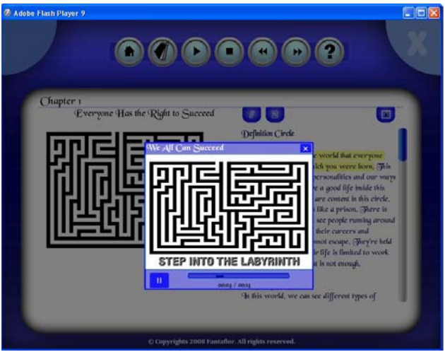
Figure 5 Chapter Video Summary