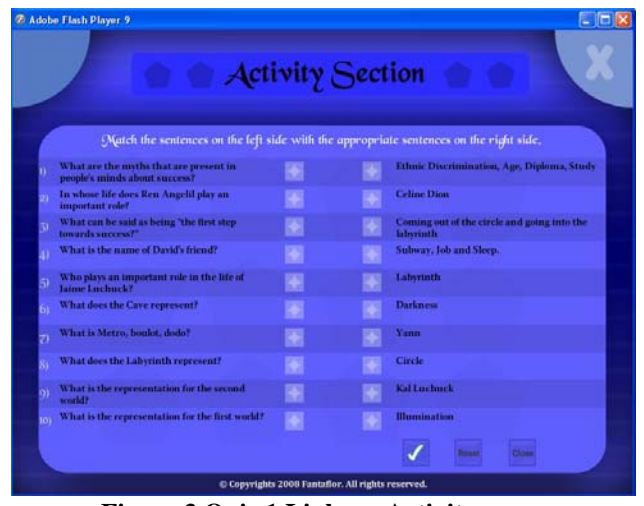
Figure 3 Quiz 1 Linkage Activity