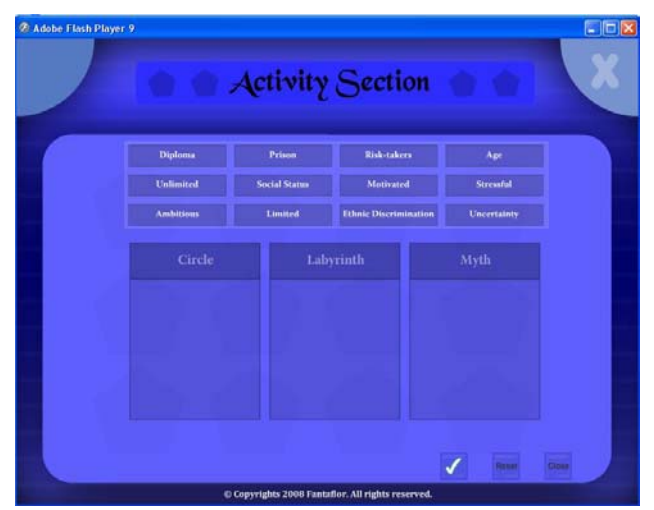
Figure 4 Quiz 2 Drag and Drop Activity