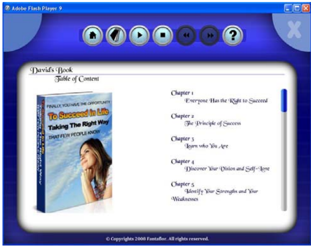
Figure 1 IBook Front View

navigating into the book for content and gives the user an extra level of interactivity which closely mimics the realworld book as shown in the table of contents view shown in Figure 1. When the user clicks a particular chapter for viewing he is presented with the view shown in Figure 2. Here the reader is not only able to read the chapter's contents but can also listen to it with voice over feature: as soon as chapter opens the text of the chapter is played with the portion that is being played highlighted in yellow. The voice over facility is what makes IBook particularly unique and sets it apart from other works in the eLearning domain: this is the first such work which gives user an extra level of multimedia interactivity with voice over capability thereby being able to grasp his attention towards the content of the book. The reader is also given the capability to stop or pause the audio at any point thereby adding interactivity to the reading/listening process. Navigation features are also included within each chapter of IBook while the reader browses through the book.