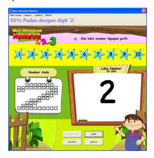
Fig. 2. The HLN's snapshot

Although Microsoft Visual Basic is good for developing the recognition engine, we encountered that one of its drawback is it cannot fulfill the type of interface that we want. It has limited functions that enable us to create the system which contains entertaining features as what the children want. Hence to make the user interface more attractive, we use Macromedia Flash MX. Macromedia Flash is well known software that enables its user to create a catchy animation. The user interface of the system is in the shockwave file format. By using the software we can create dozens of the graphical element, animation, audio recording and embedded it in into the system. Our user interface design theme for the handwriting recognition system is learning in an orchard playground. Fig. 2 shows the some screen snapshot of the HLN.