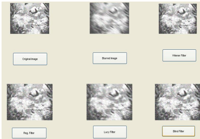
Fig. 4 original image with add Gaussian noise Alfa=0.5 when PSF Known