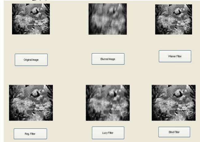
Fig. 2 Deblurring image without add noise When PSF Known, image blurred by motion blurred Length =10 and Theta=50

In the first category the regularized, Wiener and blind techniques produced what appeared to be the best results but it was surprising that the Lucy-Richardson technique produced the worst results in this instance see this result in the Fig.(2).