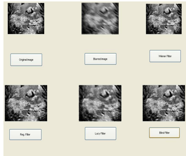
Fig. 3 Deblurring image without add noise when PSF Known, image blurred by motion blur Length= 20 and Theta=150.

In second category when Gaussian noise was added to the image in addition to blur the Lucy-Richardson algorithm actually performed the best results from the Wiener, Regularized and Blind techniques. These results can be seeing in the Fig. (4).