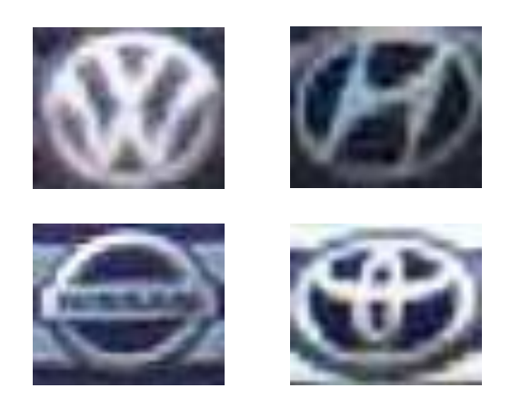
Fig 2: Example of vehicle logos image from dataset

The dataset contain vehicle logo with four classes .Each class refers to a vehicle logo name. The first class is Volkswagen logos, the second one is Hyundai logos, the third one is Nissan logos, and the last one is Toyota logos.